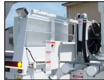
Tire Life tank and O-Ring rack.