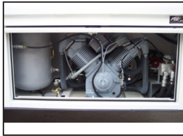
H150 air compressor with PTO/hydraulic drive. 127 CFM with a 23 or 38 gal. tank.