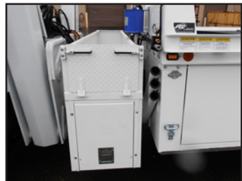
Cross-body block basket with a fold-down side and tool boxes available depending on chassis length and configuration. Sahara air dryer also shown.