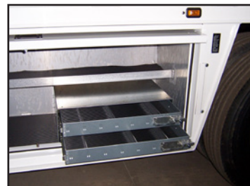
Tool drawers available for carrying small parts and tools.