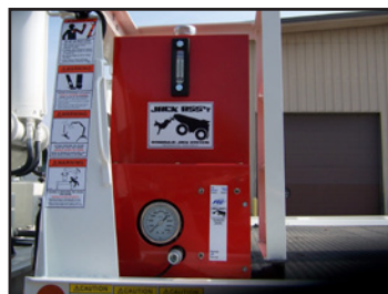
10,000 psi Jack Assist available.