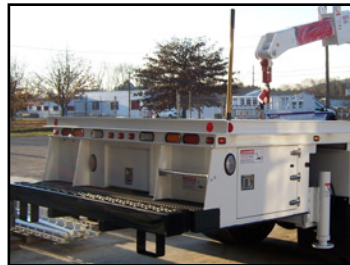
Optional rear step and grab handle for easy access to the bed.