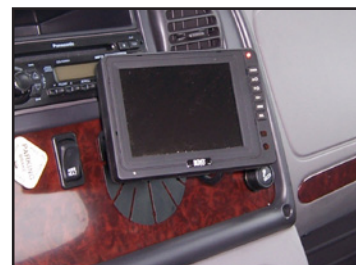
Optional backup camera.