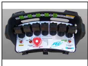
Optional fully proportional radio remote control with unique manual lever backup in case remote system is lost or damaged.