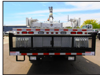
Optional rear fold-down block basket.