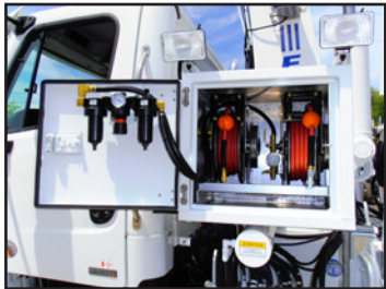
Hose reels commonly placed in slew box on left side. 1/2" X 50' and 3/8" X 50' heavy duty reels with hose end guard, Optional airing station for easy tire inflation is available.

The OTR Plus service vehicle for a tandem chassis. A 22017 Crane with optional TP145PR Tire Positioner on this heavy-duty unit will get the job done. Your customers demand the best, so should you.