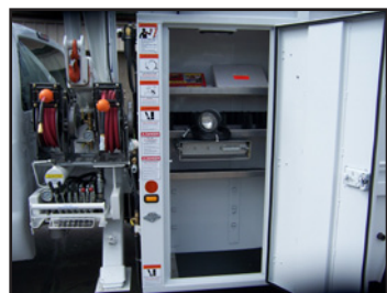
Large tool compartments are available for locked tool storage.

FLEET EQUIPMENT CORPORATION THE MOST TRUSTED NAME IN TIRE TRUCKS. Franklin Lakes, NJ ■ 800.631.0873 ■ www.fectrucks.com