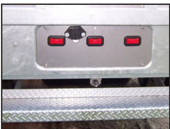
7-pin trailer plug available for testing trailer lights. Optional backup camera for safety while reversing.