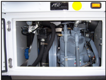
H65 air compressor with PTO/hydraulic or diesel engine drive. 60 CFM with a 23 or 35 gal. tank. Available under floor (shown) or in bed.

The Spartan Mini Plus OTR service vehicle is available in lengths of 13' and 15'. Our unique modular construction utilizing aircraft-grade fasteners allows this workhorse to stay flexible, yet durable. It also allows the body to be repaired quickly in the case of an accident, minimizing downtime. Most body parts and tool boxes can be unbolted and quickly changed with pre-painted replacements to keep you working. Your customers demand the best, so should you.