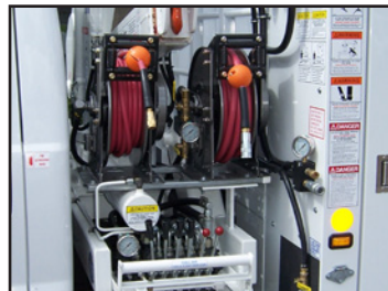
Hose reels commonly placed on left side above the crane controls. 1/2" X 50' and 3/8" X 50' heavy duty reels with hose end guard,