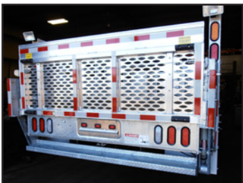
2000 lb. liftgate with heavy duty steel frame and aluminum platform. Self locking two-point spring loaded lock system locks platform closed when stored for travel. Optional self locking tire stacking rack on platform.