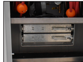
Tool drawers available for carrying small parts and tools.