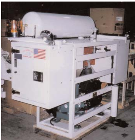
THE RAM JET CAN BE DROP SHIPPED TO YOUR LOCATION FOR INSTALLATION BY YOUR PERSONNEL